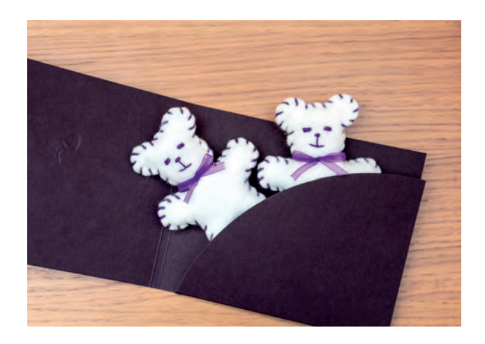
and you can personalise it in your own special way.

It's so important that you feel able to ask us anything and we encourage questions, no matter what. Your child's funeral is unique