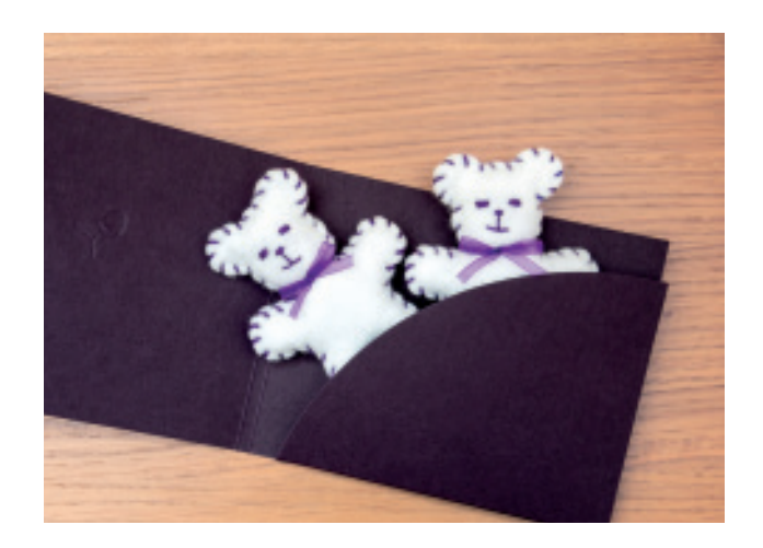
and you can personalise it in your own special way.

It's so important that you feel able to ask us anything and we encourage questions, no matter what. Your child's funeral is unique